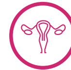
婦科日症治療 Day-case gynaecological procedures