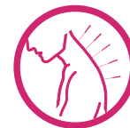
肌骨痛症門診治療 Clinical treatments for musculoskeletal pain