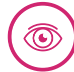
眼科日間手術 Eye day surgeries