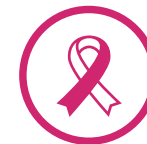
乳房健康指導及治療 Guidance and treatments to support breast health